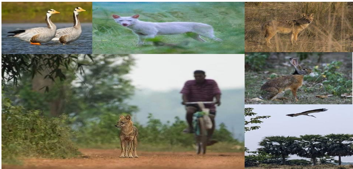
Figure 10: Biodiversity of Idilpur, Banka-Siphon, Banka River, Ponds & Land, and Kanchannagar D. N. Das High School