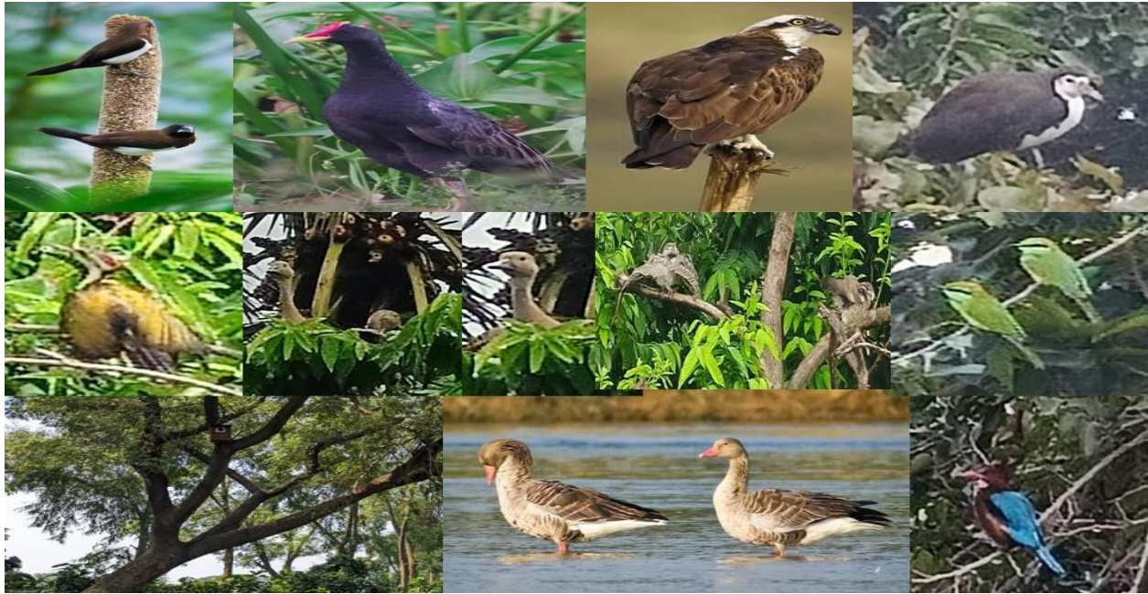
Figure 7: Birds of Idilpur-Damodar and Banka-Siphon