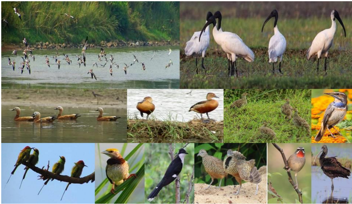
Figure 9: Biodiversity of Idilpur, Banka-Siphon, Banka River, and Ponds & Land