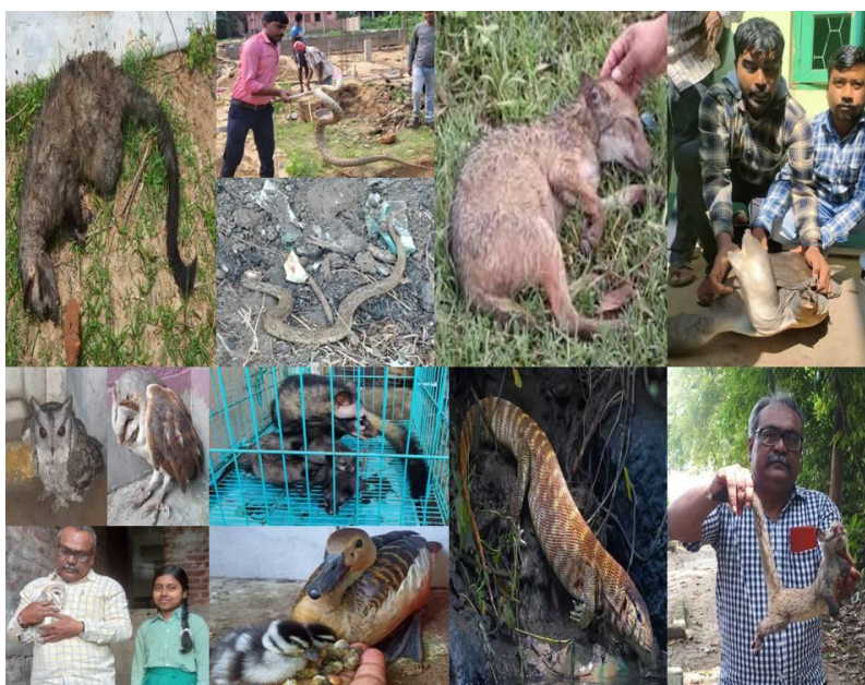
Figure 3: Position of Biodiversity of Animals in Kanchannagar; Damodar-Based, Idilpur, Banka-River, Banka-Siphon, Pond and Land

But the number of mysterious death of migratory birds in the Damodar riverbed in Kanchannagar was decreasing significantly due to; climate change, loss of habitat, dwindling green patches, tourism, selection of un-scientific bird-watching places, hi-tech lighting, vigorous sound activities, killing, poison baits, pollution, cutting the trees, human encroachment, farming, disturbing, catching, unethical human behaviours, socio-economic conditions, lack of awareness, environmental consciousness, conservations (Figure 2 & 3), and urbanization, etc. badly affected 'Wetland DRB-Biodiversity', and it adversely impacts the environment and societal problems (Roy et al., 2016; Datta, 2023a,2023b; Datta and Das, 2023; Chakraborty, 2023).