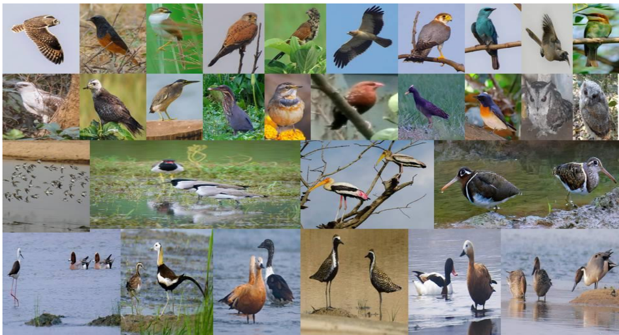
Figure 8: Birds of Banka-Siphon