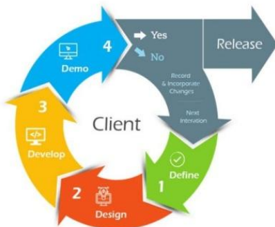
Fig 2. Software Development Process

The development process followed an agile methodology, incorporating iterative design, development, demonstration, and release phases. This approach facilitated continuous improvement based on user feedback and technical requirements. The agile framework was selected for its flexibility and responsiveness to changing requirements, which is essential in rapidly evolving technological environments [19].